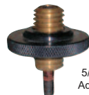
5/8" Accessory Adaptor (10250)

York Survey Supply Centre manufactures a full range of Ground, Wall and Floor Markers, suitable for a variety of conditions and marking requirements. Please call for details.